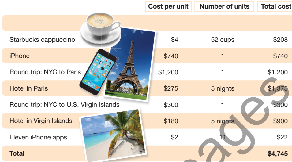
Exhibit 1.3 What Could You Buy with $4,745?

like budgets of money and leisure time. In many circumstances, people are already putting their resources to best use. Occasionally, however, economic reasoning can help people make better choices. In other words, economic reasoning can help you be a better optimizer.