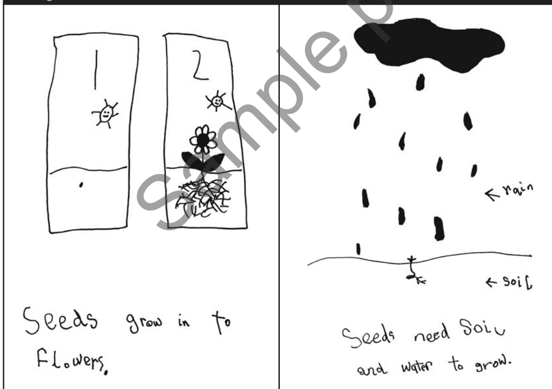
Two Pages From a First Grader's "Seeds" Book