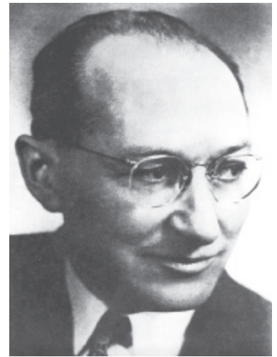
Kurt Lewin (1890–1947).