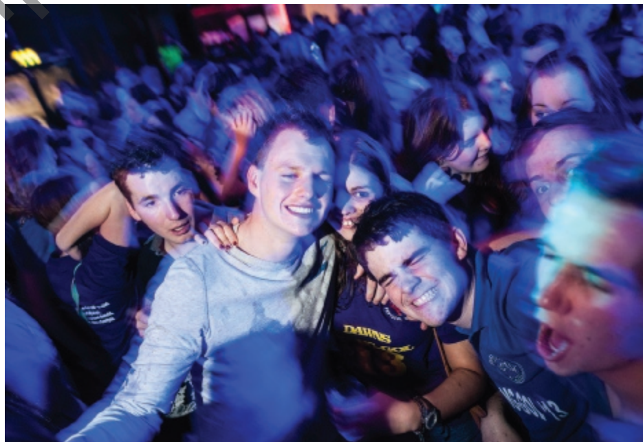
Our thoughts, feelings, and actions are influenced by our immediate surroundings, including the presence of other people—even mere strangers.

The effect that the words, actions, or mere presence of other people have on our thoughts, feelings, attitudes, or behavior