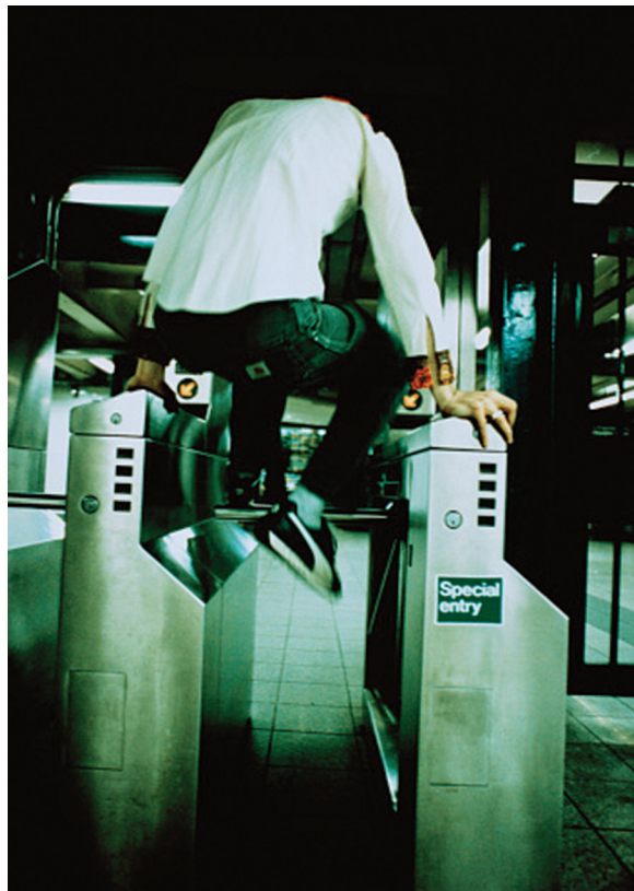
A free rider in the New York subway system. Are you paying for this person to ride the subway?

have much more to say about this example of equilibrium analysis in Chapter 4.)