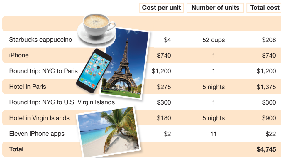
Exhibit 1.3 What Could You Buy with $4,745?

like budgets of money and leisure time. In many circumstances, people are already putting their resources to best use. Occasionally, however, economic reasoning can help people make better choices. In other words, economic reasoning can help you be a better optimizer.